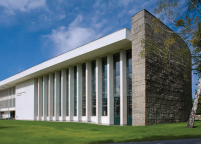
Henry-Ford-Bau

The Botanikertagung 2011 will be held in the Henry Ford Building (HFB) on the campus of the Freie Universität Berlin in Berlin-Dahlem. The HFB offers state-of-the-art audio-visual facilities in all lecture halls and can be conveniently reached by subway from downtown Berlin or by bus/subway from Potsdam.